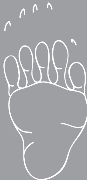
Malayan Sun Bear